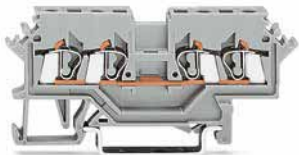
4-conductor through terminal block