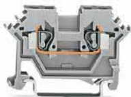
2-conductor through terminal block