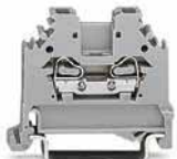
2-conductor through terminal block